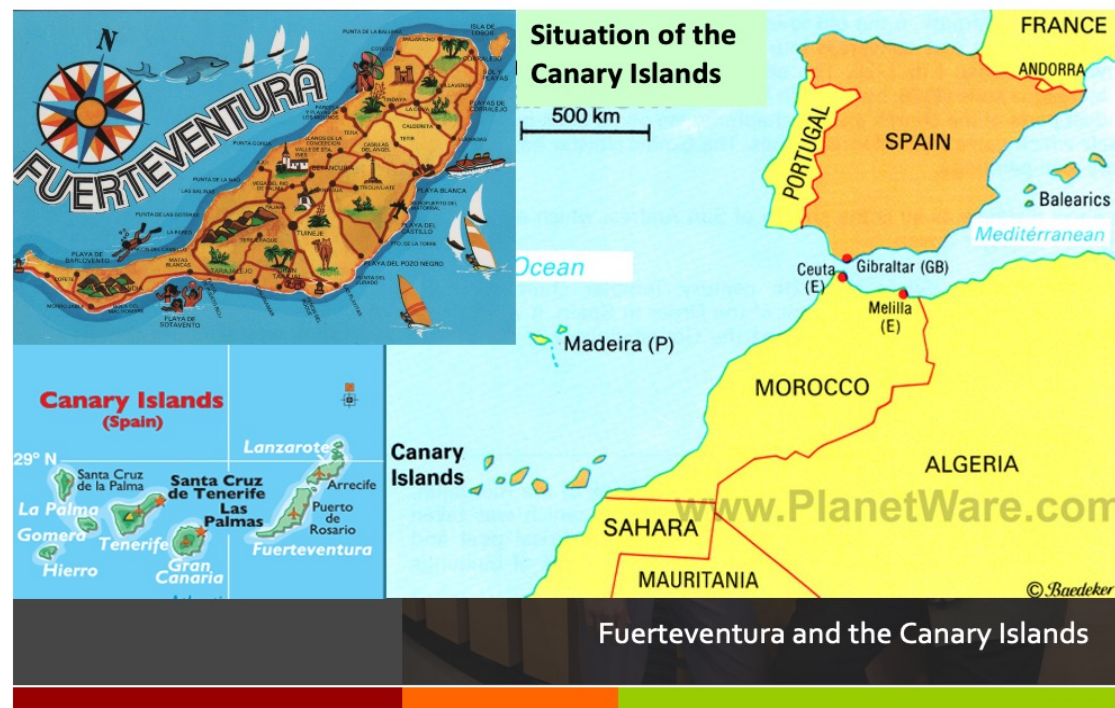
Fuerteventura and the Canary Islands

The Canary Islands consist of seven different islands from largest to smallest as follows: Tenerife, Fuerteventura, Gran Canaria, Lanzarote, La Palma, La Gomera and El Hierro. The islands are an archipelago and also include a number of islets. The islands have a subtropical climate, with long warm summers and moderately warm winters.